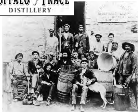
The Distillery in 1870.