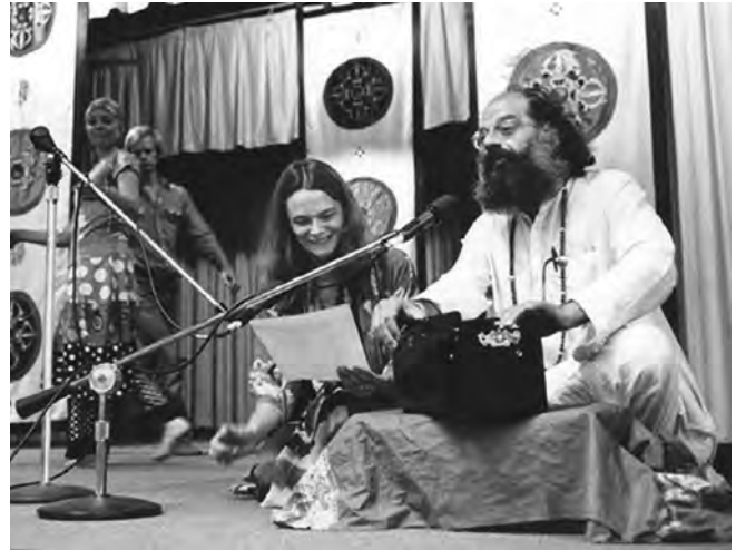
Ginsberg, Waldman, Dilley @ Naropa University (being recorded).

Sponsored by the Maria Rogers Oral History Program of the Boulder Public Library's Carnegie Library for Local History, Boulder, Colorado, Protest & Poetry features a recording of poet Anne Waldman reading her own protest poetry and a poem by Allen Ginsberg at a 2006 reunion of activists who protested against the Rocky Flats nuclear weapons plant in the 1980s. Poems include "Plutonium Ode," "Mega Death Chant," and "I Remember Being Arrested."