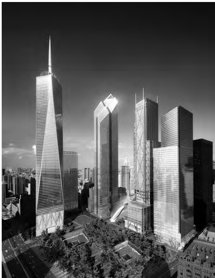
The final proposed design for the rebuilding of the World Trade Center. The September 11th Memorial is in the park in the foreground.