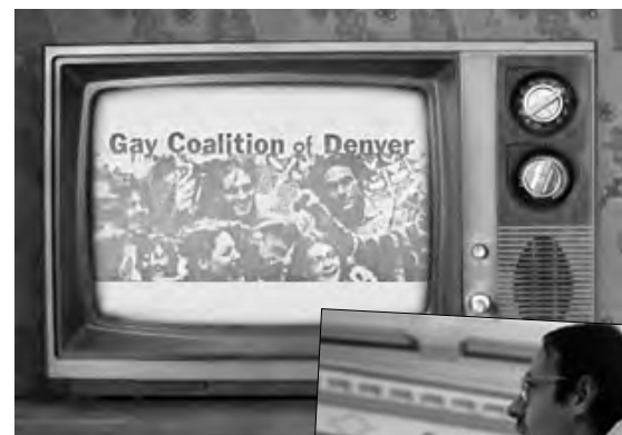
Gay Revolt.