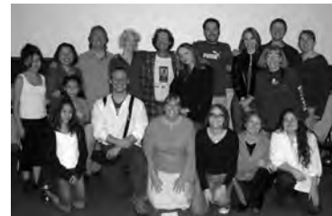
Romero Theater Troupe