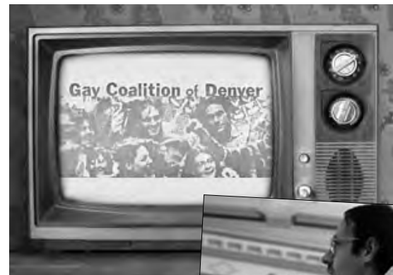
Gay Revolt.