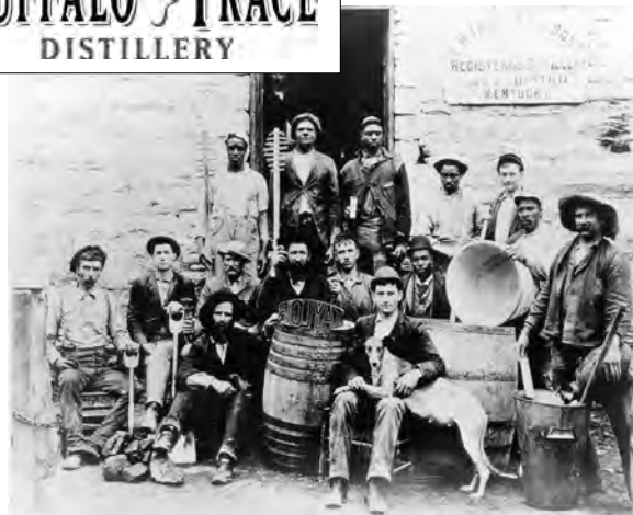
The Distillery in 1870.